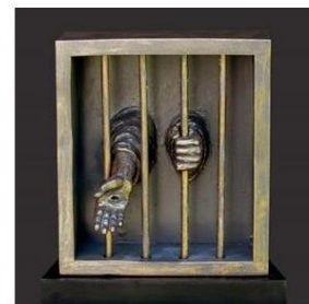
When I was in prison...

As you did for the least of my brothers and sisters, you did for me.