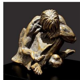
When I was naked....