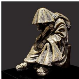
When I was a stranger...