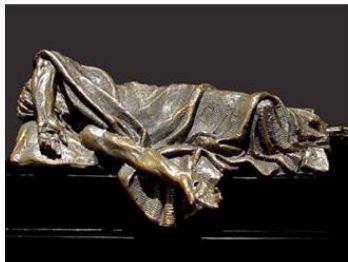
When I was sick...